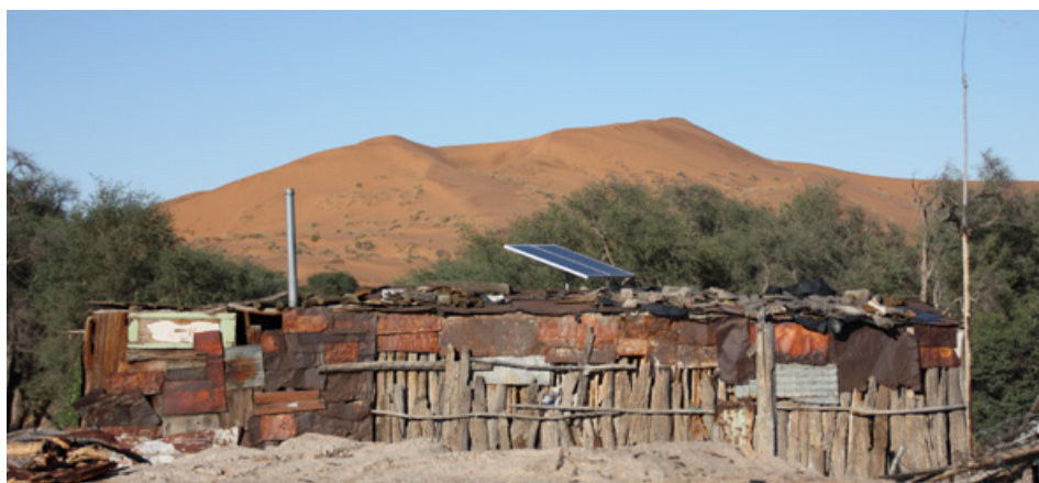
Non-electrified Topnaar settlement using a solar home system in the Erongo Region in Central Namibia where NEED conducted a survey to assess the sources and use of energy amongst the Topnaar community (March 2015).

Several case studies have been conducted, e.g. at the Chobe Game Lodge and the Guma Lagoon Lodge in Botswana, for the development of a simulation model of typical wetlands tourist facilities. These included collecting and evaluating local energy production and consumption data. A simulation-based case study with the Topnaar community in the Namibian desert was conducted in order to show the technical and economic options of village electrification based on a solar photovoltaic mini-grid. This included a local community workshop to explain all aspects of the operation of a mini-grid, such as the maintenance and management of the installations.