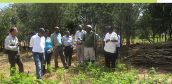
Visit to the Biomass Test Facility at Thomro Biofuels, Lusaka, Zambia (April 2014).

Botswana, Namibia and Zambia have a comparable state of the introduction of RET with respect to their policy background and presence of significant renewable energy potential. The majority of their populations depend on firewood and charcoal for cooking and hot water supply, which poses serious threats to the environment, health and economy because local resources are used unsustainably, generating the risk of deterioration of valuable soil necessary for food production. Simultaneously, because of the favourable climatic conditions, the use of solar-based RET in these countries has enormous potential. The availability of sustainable and affordable energy is considered vital for development.